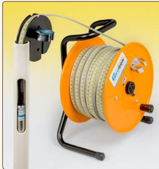
● Model 1900-11, shown with Index Mark and Reed-Switch Probe in 1" pipe.