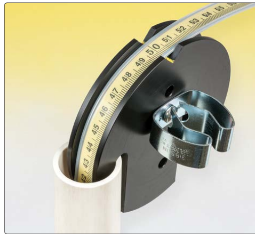
• Model 1900-11, Index Mark closeup.