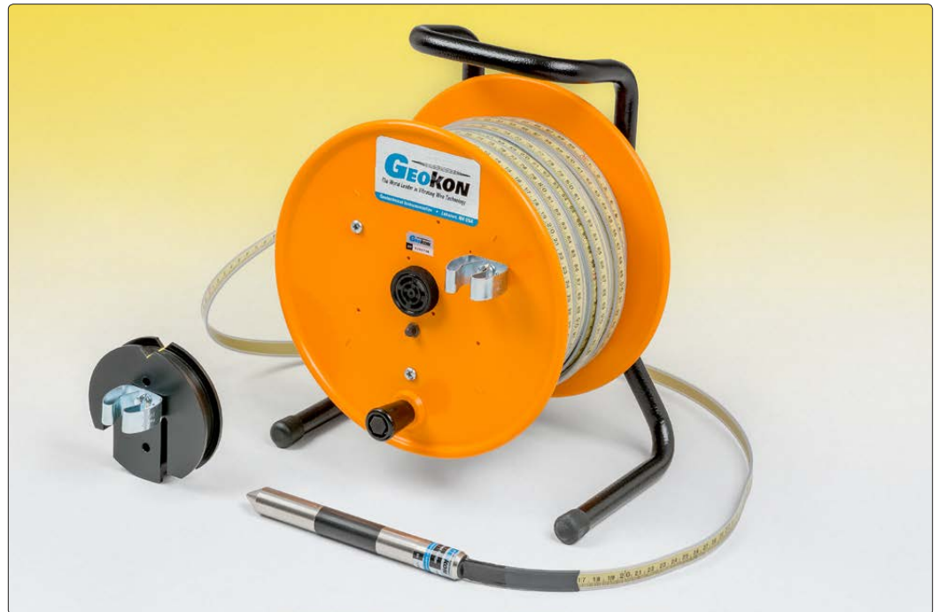
● Model 1900-11 Reed-Switch Probe and Index Marker.