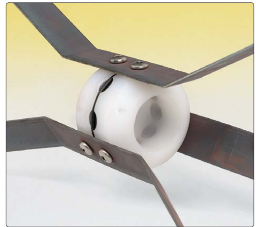
• Model 1900-7A Spider Magnet (double-ended) for 1" pipe.