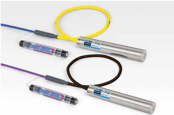
Model 3400SV Vented Semiconductor Piezometer.