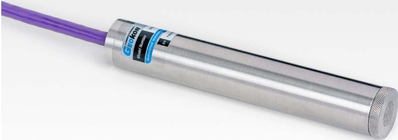
Model 3400S Semiconductor Piezometer