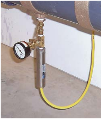
Model 3400H and Dial Gauge Pressure Transducer on a tee fitting.