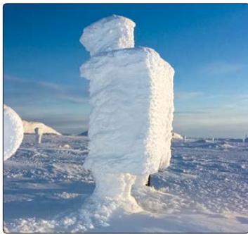
• Winter view of the above installation.*