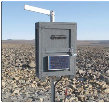
• Summer view of the GEOKON® Model 8025 Data Acquisition Station measuring a 70 m deep Thermistor String in mine tailings, located in northern Canada.*