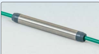
• Close-up of an encapsulated sensor from the Model 3810A (Addressable) Thermistor String.