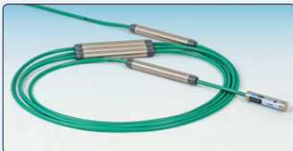
• Model 3810A (Addressable) Thermistor String, shown with 5 sensors.