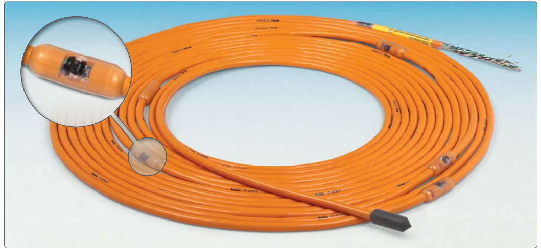
• Model 3810 Thermistor String (inset shows a close-up of an encapsulated sensor).