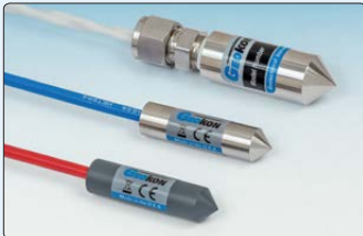
• Model 3800-1-1, Model 3800-2-1 and Model 3800HT Thermistor Probes.