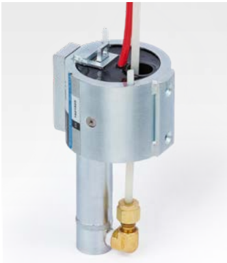
Model 4360-1-1 Soft Inclusion Stress Cell (hydraulically activated).