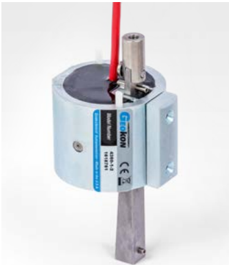
Model 4360-1-2 Soft Inclusion Stress Cell (mechanically activated).