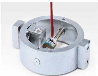
Model 4360-2-2 Soft Inclusion Stress Cell (mechanically activated).