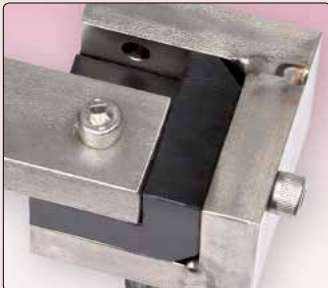
• Closeup showing alignment blocks, used during installation, for correct spacing.