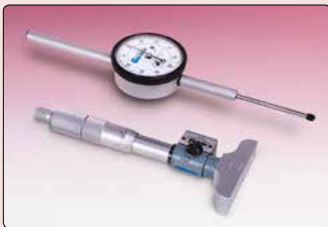
• Model 1400-1 Dial Indicator (top) and Model 1400-4 Digital Depth Micrometer.