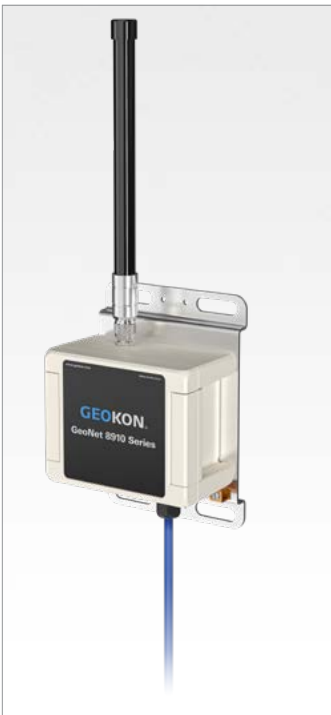
GeoNet Vibrating Wire Data Logger.

Displacement transducers can be customized to meet your needs. Our staff will work with you throughout the process. Common customizations include waterproofing, high-temperature operation, corrosion resistance, specialty cables, etc.