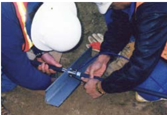
Attaching the end flange.