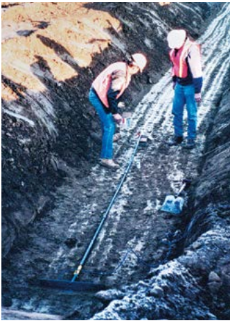
Installation of Model 4435 sensors.