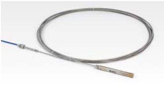
Model 4500HT shown with TEC cable (coiled, pre-installed configuration).