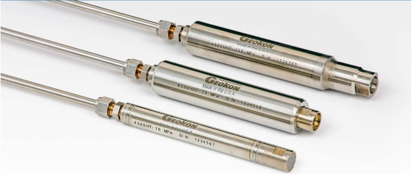
Model 4500HT High Temperature Piezometer (front) and Model 4500HT High Temperature Pressure Transducers (center, back).