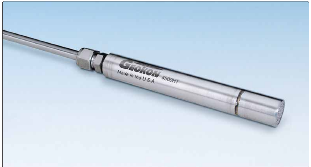
• Model 4500HT High Temperature Vibrating Wire Piezometer.

Geokon's 4500HT Series High Temperature Piezometers and Pressure Transducers are designed for monitoring downhole pressures and temperatures in oil recovery systems and geothermal applications.