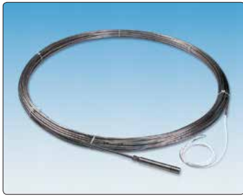
• Model 4500HT shown with Teflon® cable inside stainless steel tubing (coiled, pre-installed configuration).