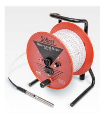
Solinst Model 101 Water Level Meter.