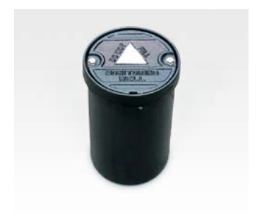
Typical well cover.