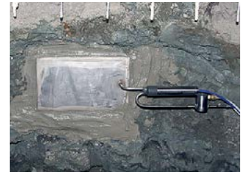
Model 4850 NATM Shotcrete Stress Cell with remote re-pressurization option.