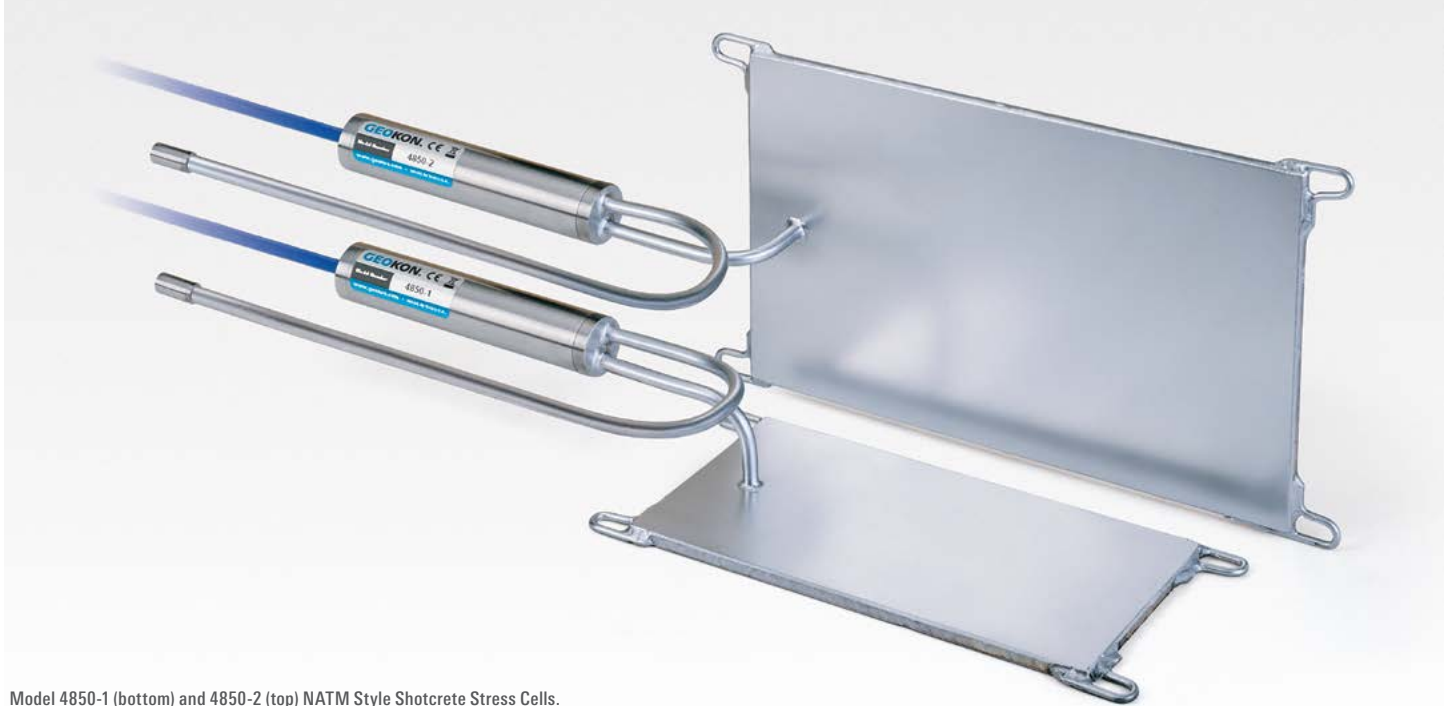
Model 4850-1 (bottom) and 4850-2 (top) NATM Style Shotcrete Stress Cells.