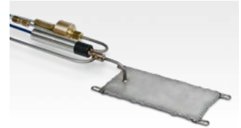
Model 4850 NATM Shotcrete Stress Cell with electro-hydraulic pressure switch (for confirmation of measured pressure).