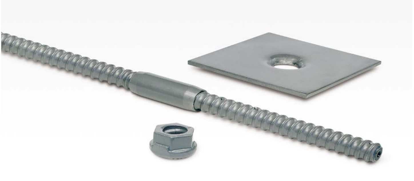
Model 4910 Instrumented Rockbolt components (front to back: nut, rockbolt and mounting plate).