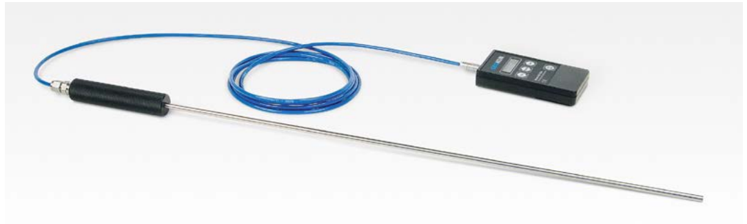
Model 4910 Probe shown with the Model GK-404 Vibrating Wire Readout.