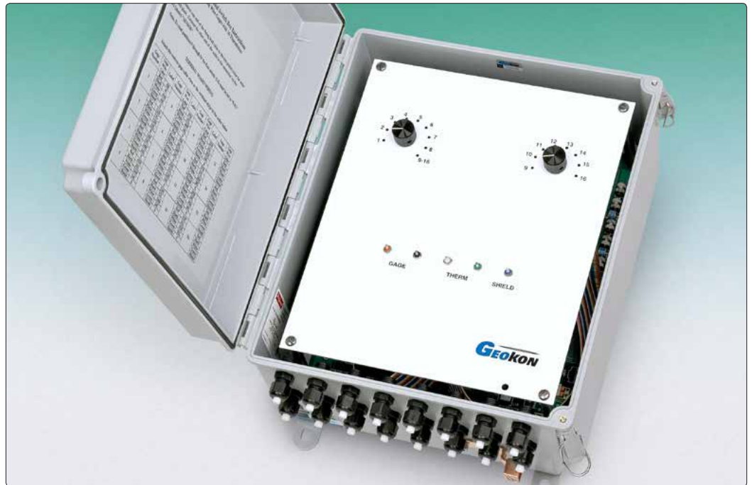
• Model 4999-16VTS Terminal Box.