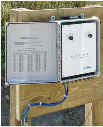
● Model 4999-16VTS