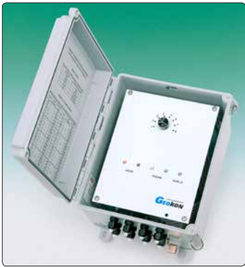
● Model 4999-11-8S