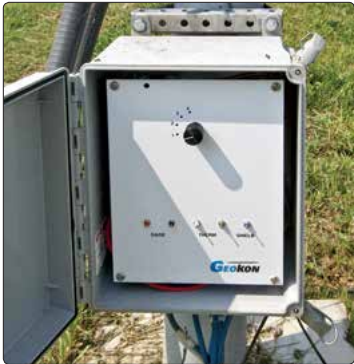
● Model 4999-11-4S