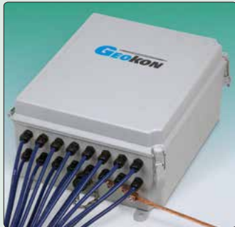
• Model 4999-16VTS Terminal Box.