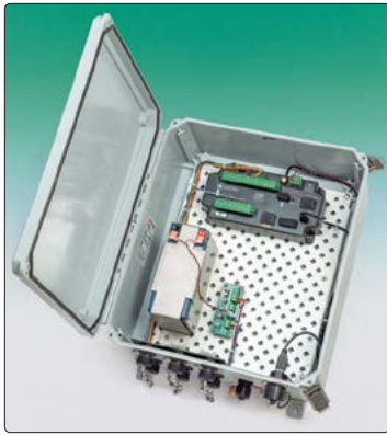
• Model 8600-1 Datalogger.