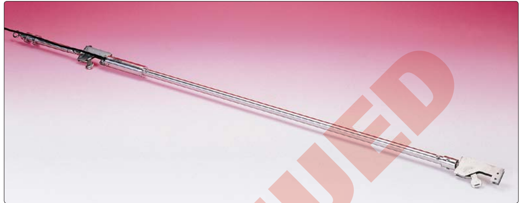
• Model 6155 MEMS Horizontal In-Place Inclinometer.