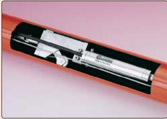
• Installation detail with a cutout section of the Model 6155 Inclinometer Casing.