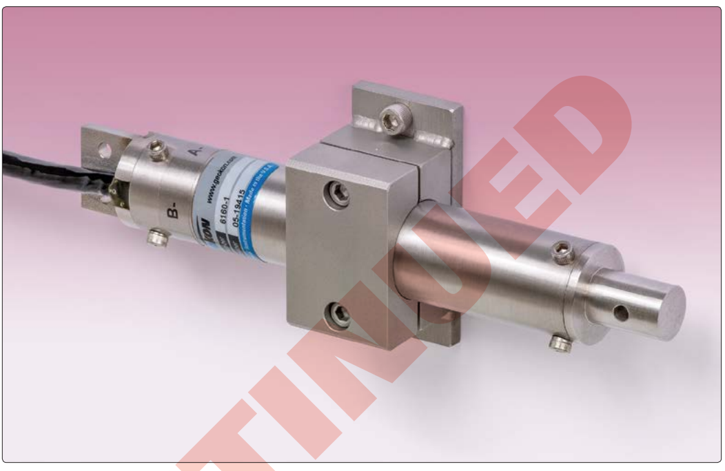
Model 6160A-1 Uniaxial MEMS Tilt Sensor with horizontal mounting bracket assembly.