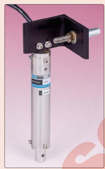
Model 6160A-2 Biaxial MEMS Tilt Sensor with mounting bracket assembly.