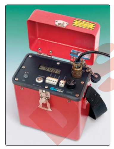
• The Model RB-500 MEMS Readout for use with the Model 6160 Tilt Sensors.