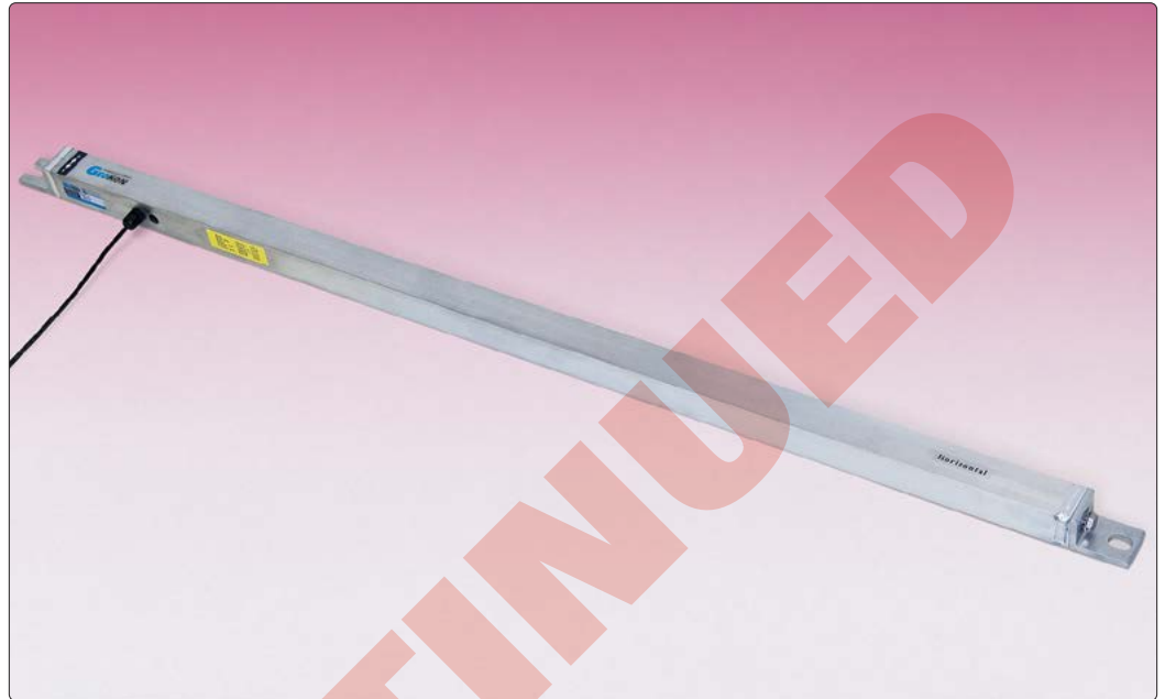
• Model 6165 MEMS Tilt Beam.