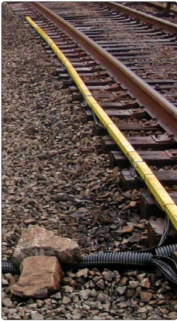
● MEMS Tilt Beam (fiberglass version) installation alongside railroad tracks.