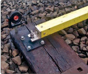
● MEMS Tilt Beam mounting attachment (with optional survey target).