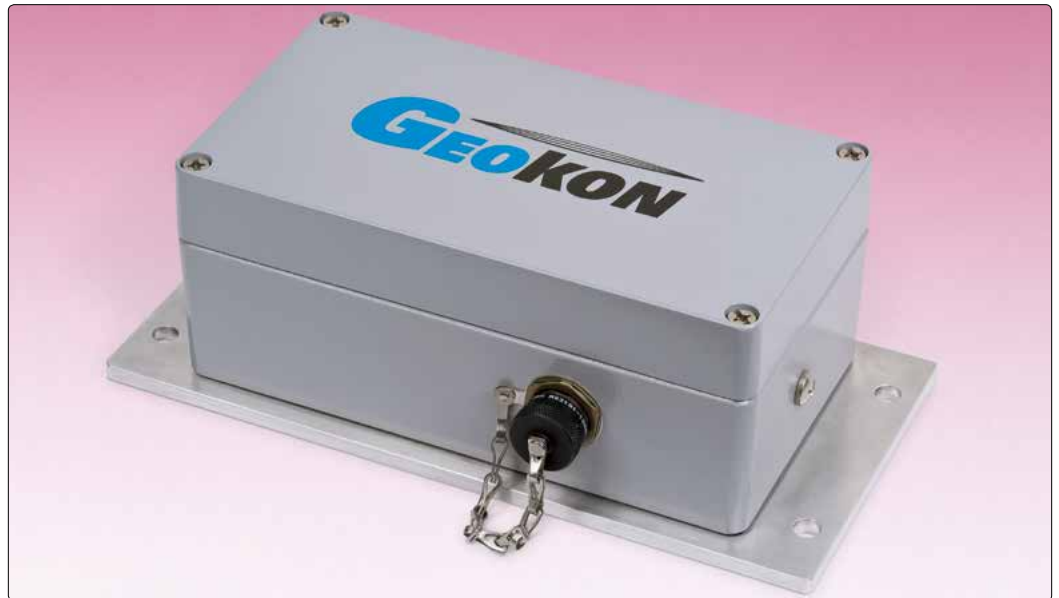
• Model 8003C-2 MEMS Datalogger.