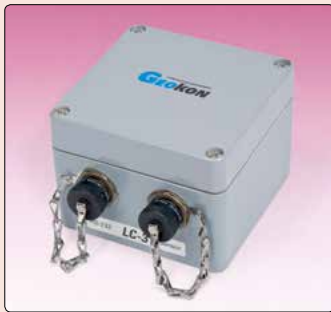
• Model 8003A-1 MEMS Datalogger.