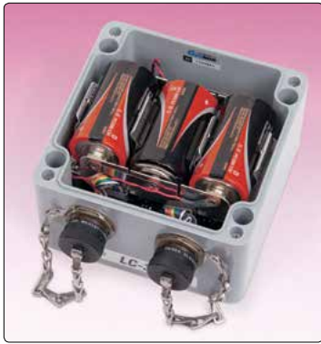
● Model 8003A-1 MEMS Datalogger shown with cover removed.