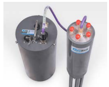
Model 8600-3 Datalogger and Model 1100 Extensometer (right).

onward transmission to a remote PC. Spread Spectrum Radios spread the normally narrow band information signal over a relatively wide range of frequencies thus allowing the communication to be more immune to noise and interference from RF sources such as pagers and cellular phones.