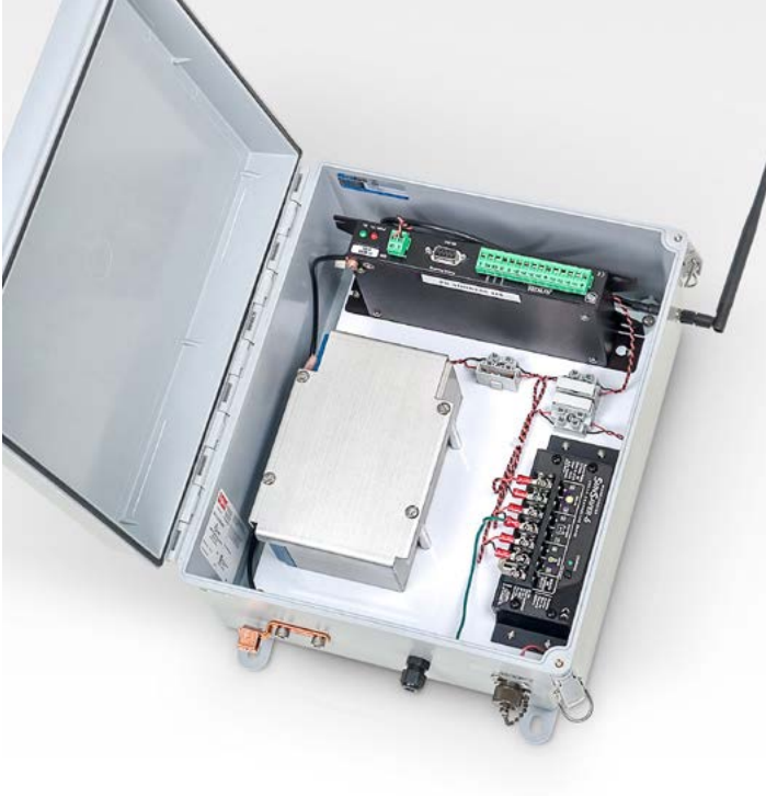
Model 8040 2-Channel Wireless Vibrating Wire Interface Module.