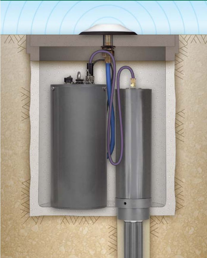
Model 8600-3 Datalogger and Model 1100 Extensometer in manhole, with manhole lid antenna.