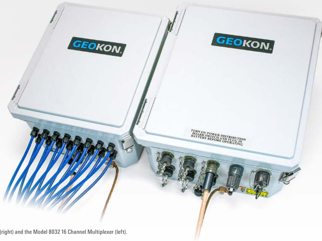
Model 8600-1 Datalogger (right) and the Model 8032 16 Channel Multiplexer (left).