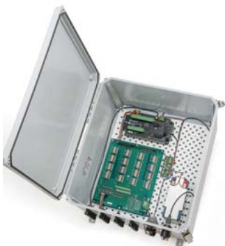
Model 8600-2 Datalogger.

can be connected to provide power to the system (please contact GEOKON for details).