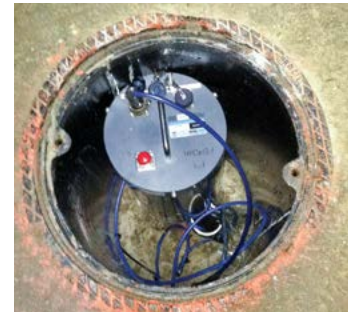
Model 8040T configured to read a Model 4500 Vibrating Wire Piezometer.

*Requires an optional radio base station (with requisite antenna) built into the Model 8600 Series Dataloggers.