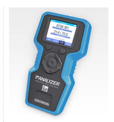
Model GK-406 Vibrating Wire Analyzer.