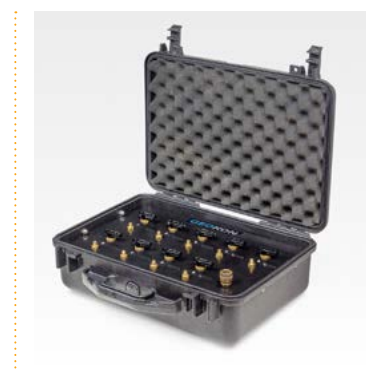
Model 1300-3 Pressure Manifold.

Readout is accomplished by connecting cables from each sensor to Model GK-404 or GK-406 Readouts. Switch panels or Multiplexers (Model 8032) are available to rapidly switch through all the active sensors.