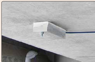
• Model ST-350, with cover, on girder.