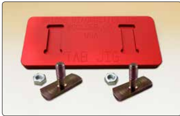
● Mounting tabs and tab jig.