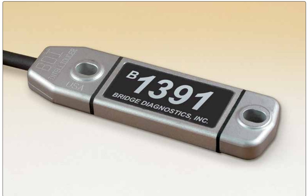
• Model ST-350 Dynamic Strain Transducer.

tel: (303) 494-3230 fax: (303) 494-5027 web: www.bditest.com