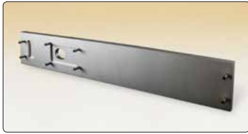
● Extension jig.