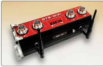
● ST3-WiFi node.