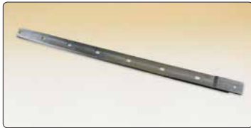
● Transducer extension for R/C structures.