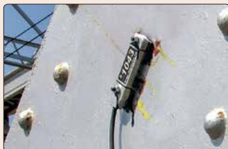
• Model ST-350 attached to steel truss.

BDI 740 S Pierce Avenue Suite 15 Louisville, Colorado 80027 USA