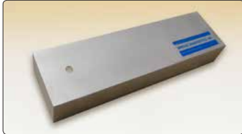
● Rugged, aluminum cover plate (optional).