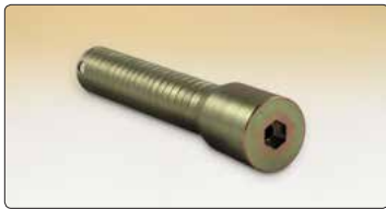
● Tab removal tool.