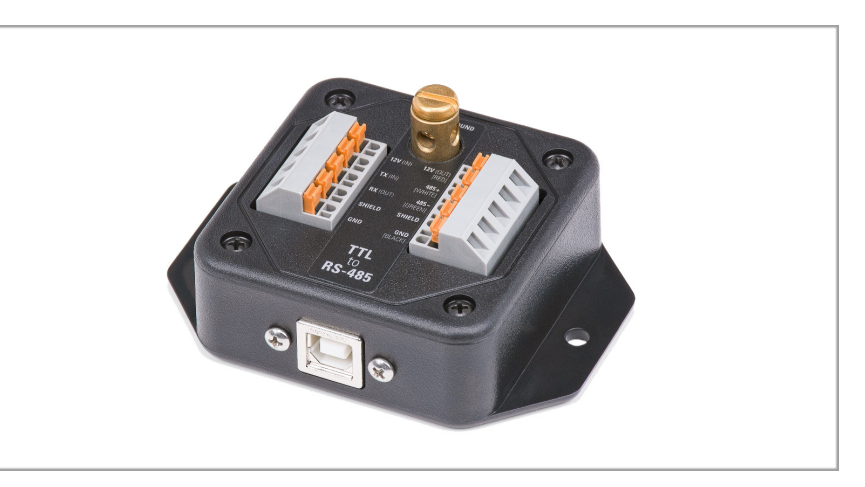
FIGURE 4: Model 8020-38 RS-485 to TTL/USB Converter

For more information, please refer to the Model 8020-38 instruction manual.