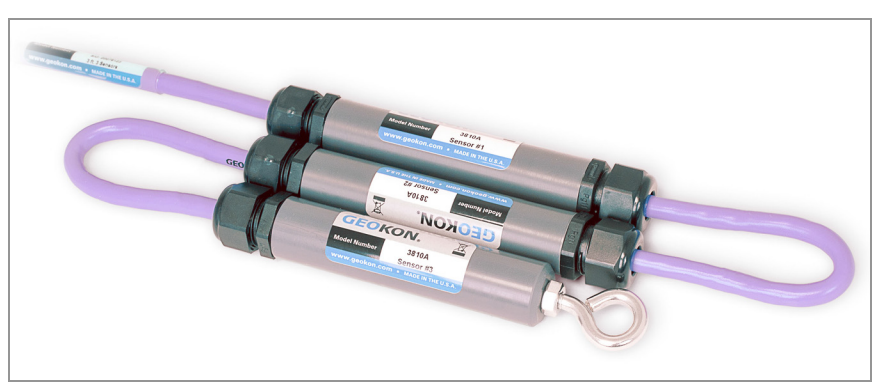
FIGURE 1: Model 3810A Addressable Thermistor String

The sensors are polled individually via industry standard Modbus RTU (Remote Terminal Unit) commands.