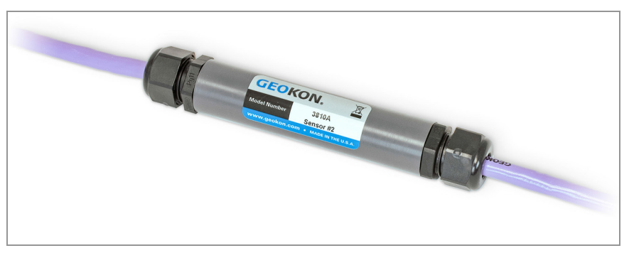
FIGURE 2: Model 3810A Addressable Thermistor