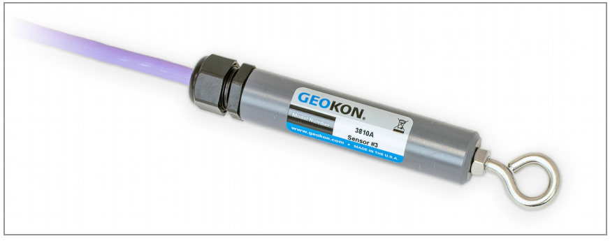
FIGURE 3: Model 3810A-3 End Terminator

Uncoil the thermistor string and place it in the installation medium. For installations in which the string will be in contact with soil, rock, etc., take care to prevent damage to the cable and sensor. The termination assembly at the end of the string is made with a 1/4-20 \times 1/2" deep threaded hole in it. This allows for a weight or cord/rope to be attached for assisting with the installation. The maximum pulling force that can safely be applied to the string is 20 lb.