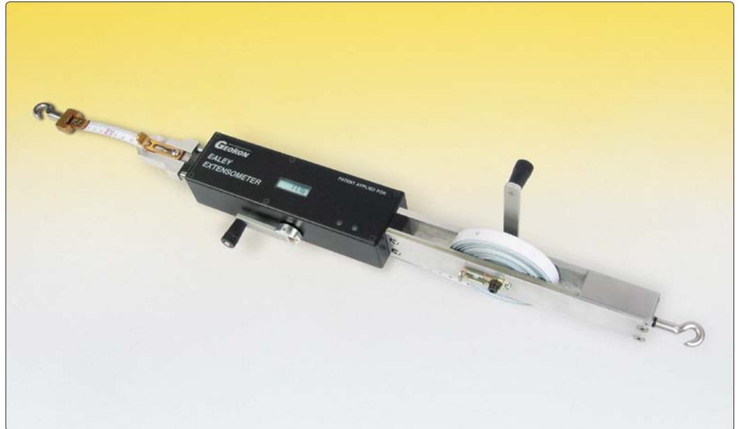
• Model 1610 Geokon/Ealey Tape Extensometer.