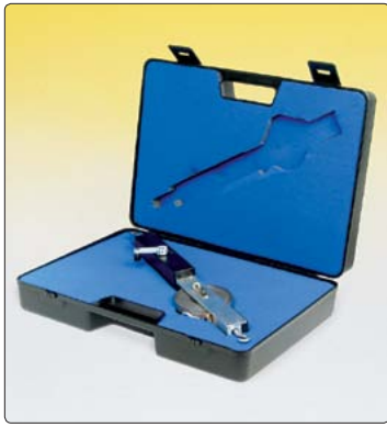
• Model 1610 shown with carrying case.