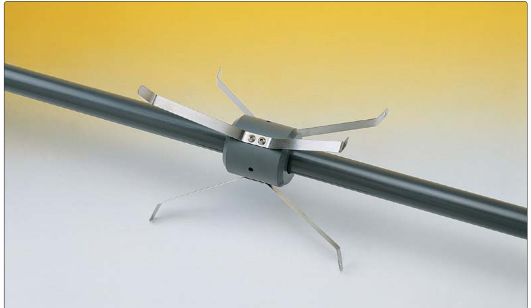
• Model 1900 Magnetic Extensometer.