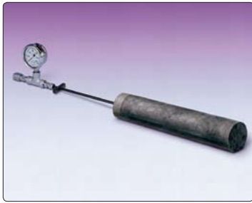
● Model 3200 BPC shown pre-encapsulated in a cylinder of quick setting cement.