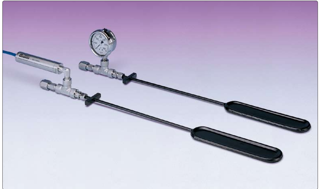
• Model 3200 Hydraulic Borehole Pressure Cells pictured with pressure transducer (front) and stainless steel pressure gage (rear).