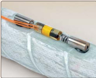
● Model 4151 Strain Gage mounted to a fiberglass rebar.