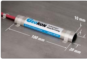
● Model 4150 under the Model 4150-1 protective cover plate, with dimensions.