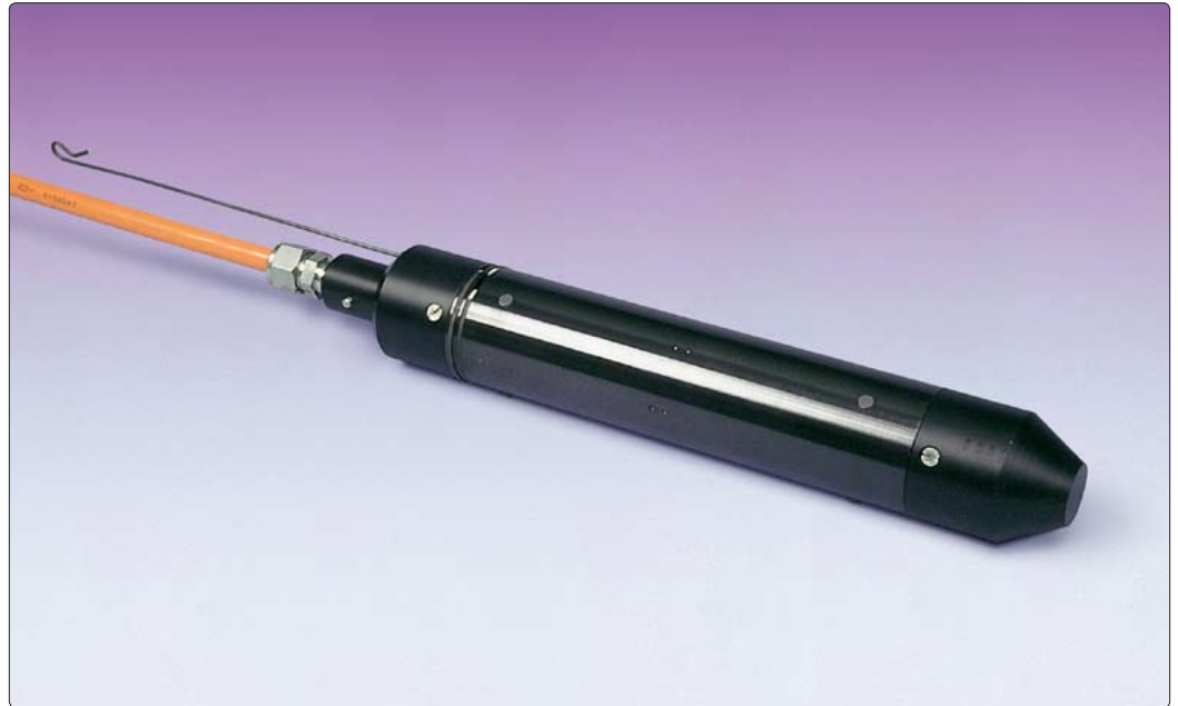
• Model 4350 Biaxial Stressmeter.