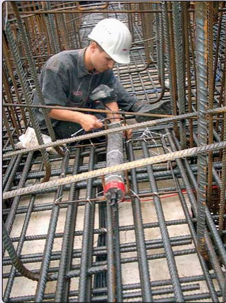
• Model 4370 installation.