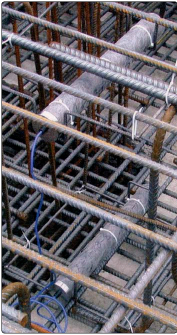
● Model 4370 installation.