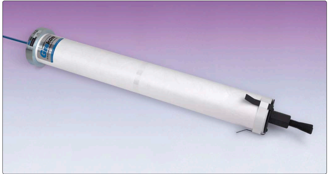
• Model 4370 Concrete Stressmeter.