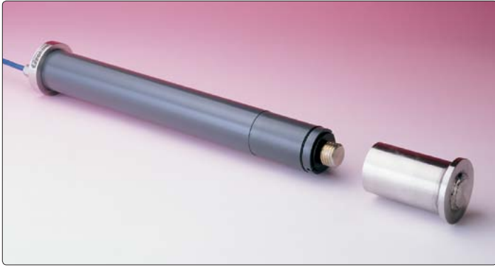
● Model 4400 Embedment Jointmeter shown with socket removed.

The Model 4400 is designed for use in construction joints; e.g. between lifts in concrete dams. In use, a socket is placed in the first lift of concrete and, when the forms are removed, a protective plug is pulled from the socket. The gage is then screwed into the socket, extended slightly and then concreted into the next lift. Any opening of the joint is then measured by the gage which is firmly anchored in each lift. The sensing gage itself, is smaller than the protective housing, and a degree of shearing motion is allowed for by the use of ball-joint connections on the gage.