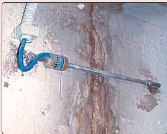
• Model 4420 Crackmeter installation.