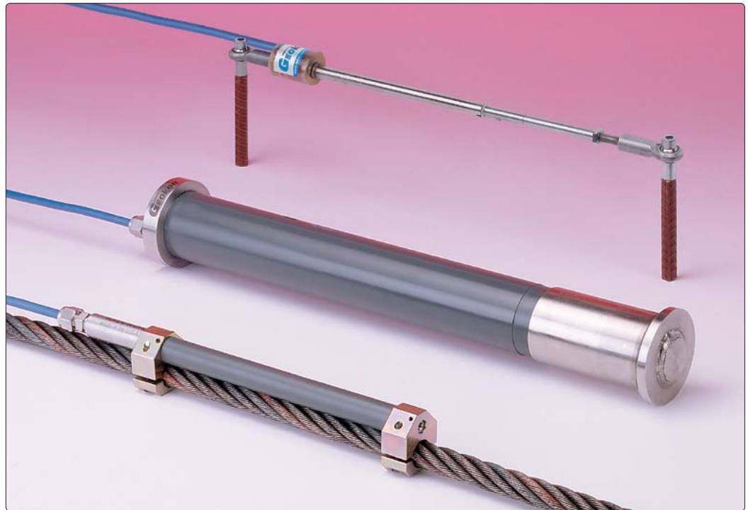
• Model 4410 Strandmeter (front), Model 4400 Embedment Jointmeter (center) and Model 4420 Crackmeter (rear).