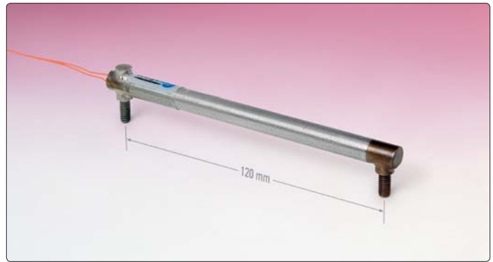
● Model 4422 Micro Crackmeter.

The Model 4422 is a miniature crackmeter intended to measure displacements across surface cracks and joints. It has been specially designed for applications where access is limited and/or where monitoring instrumentation is to be as unobtrusive as possible (e.g. on historical structures or buildings).