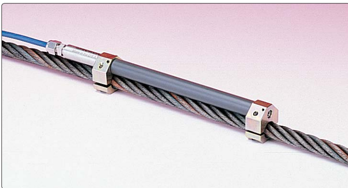
● Model 4410 Strandmeter.

The Model 4410 Strandmeter is designed to measure strains in tendons and steel cables, including bridge tendons, cable stays, ground anchors, tiebacks, etc. Two clamps at each end of the strandmeter hold it firmly onto the cable. Various size clamps are available.