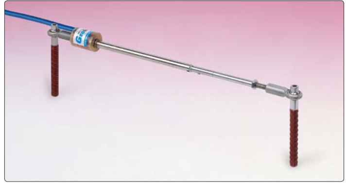
● Model 4420 Crackmeter.

The Model 4420 Crackmeters are designed to measure movement across joints such as construction joints in buildings, bridges, pipelines, dams, etc.; tension cracks and joints in rock and concrete.