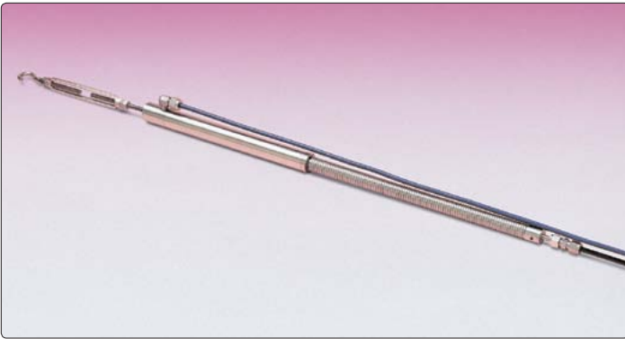
● Model 4425 Convergence Meter.

The Model 4425 Convergence Meter is designed to detect deformation in tunnels and underground caverns by measuring the contraction (or elongation) between 2 anchor points fixed in the walls of the tunnel or cavern.