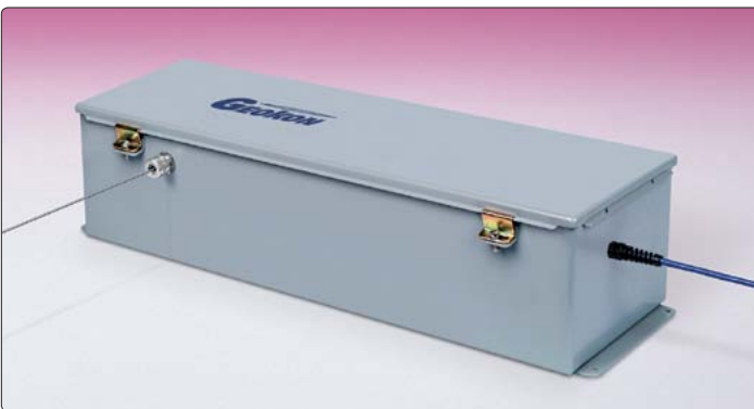
● Model 4427 Long-Range Displacement Meter.

The Model 4427 Long-Range Displacement Meter is ideally suited for the measurement of large displacements associated with landslides. The Model 4427 can also be used for monitoring the movement of boulders, snow, etc., on unstable slopes.