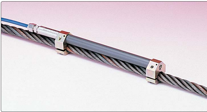
● Model 4410 Strandmeter.

The Model 4410 Strandmeter is designed to measure strains in tendons and steel cables, including bridge tendons, cable stays, ground anchors, tiebacks, etc. Two clamps at each end of the strandmeter hold it firmly onto the cable. Various size clamps are available.