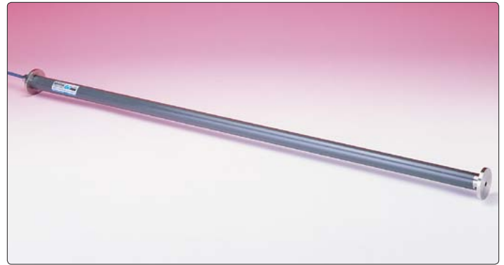
● Model 4430 Deformation Meter.

The Model 4430 Deformation Meter is designed to measure axial strains or deformations in boreholes in rock, concrete or soil. It can also be embedded in soils in embankments such as earth dams and highway fills. The Model 4430 can be installed in series to give a total deformation profile along a particular axis. Base lengths of the gage can vary from a minimum of 1 meter to over 25 meters.