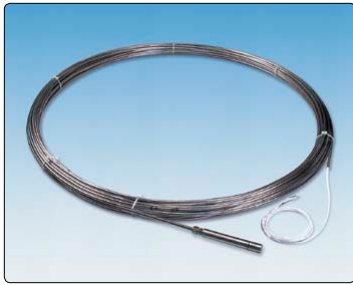
• Model 4500HT shown with Teflon® cable inside stainless steel tubing (coiled, pre-installed configuration).