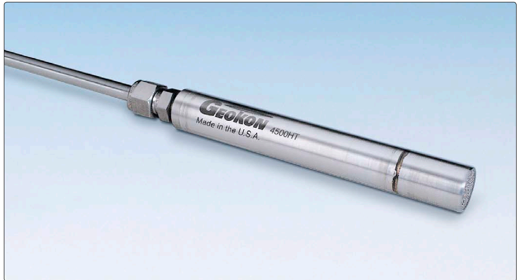
• Model 4500HT High Temperature Vibrating Wire Piezometer.

Geokon's 4500HT Series High Temperature Piezometers and Pressure Transducers are designed for monitoring downhole pressures and temperatures in oil recovery systems and geothermal applications.