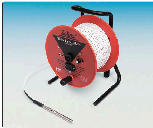
• Solinst Water Level Meter.