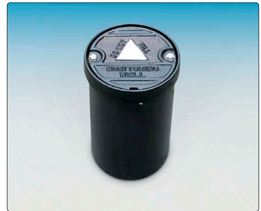
• Typical well cover.*