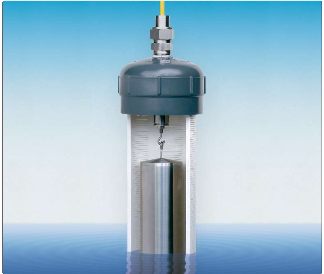
• The Model 4675LV with cutaway revealing its internal components: a cylindrical weight suspended from the vibrating wire force transducer.