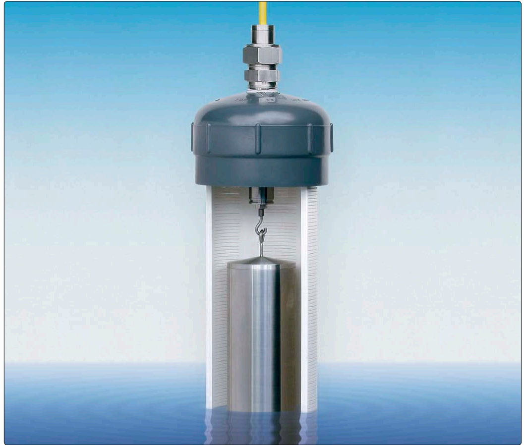
• The Model 4675LV with cutaway revealing its internal components: a cylindrical weight suspended from the vibrating wire force transducer.