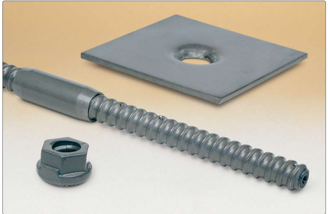
● Model 4910 Instrumented Rockbolt components (front to back: nut, rockbolt and mounting plate).