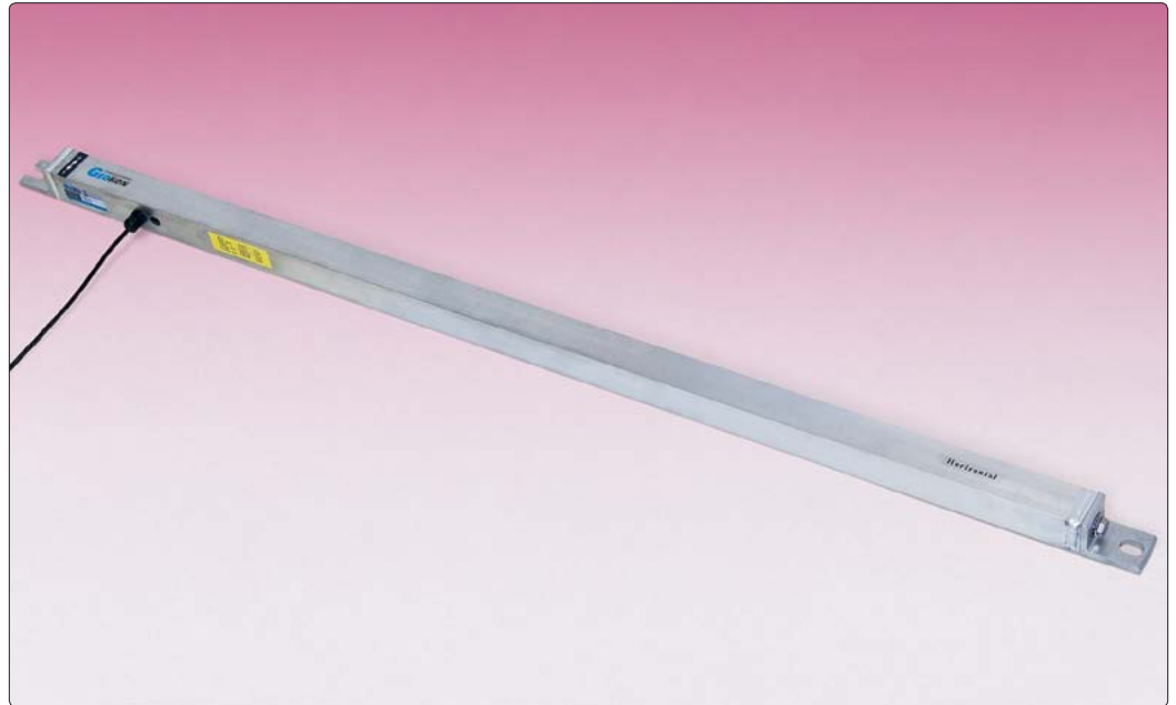
• Model 6165 MEMS Tilt Beam.