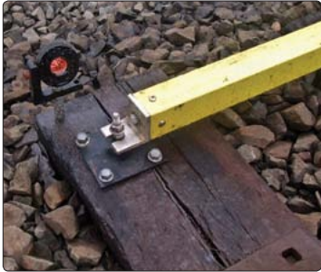
● MEMS Tilt Beam mounting attachment (with optional survey target).