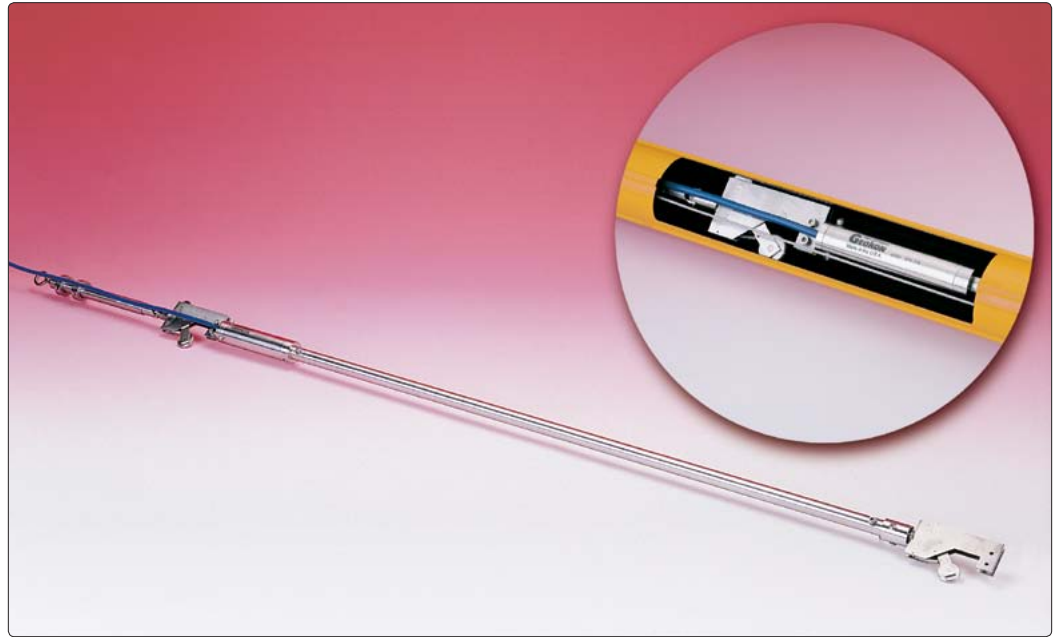
• Model 6300 VW In-Place Incliner. Inset photo reveals installation detail with section of Model 6500 Incliner Casing removed.