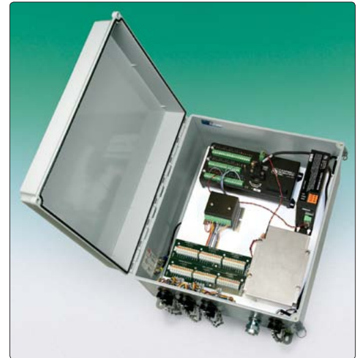
• Micro-1000 Datalogger.