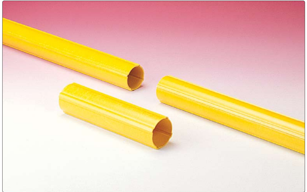
• Two sections of the Model 6500 Inclinometer Casing shown with a standard length coupling.