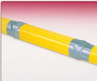
• Close-up shows two sections of the Model 6500 riveted and taped together with a standard length coupling.