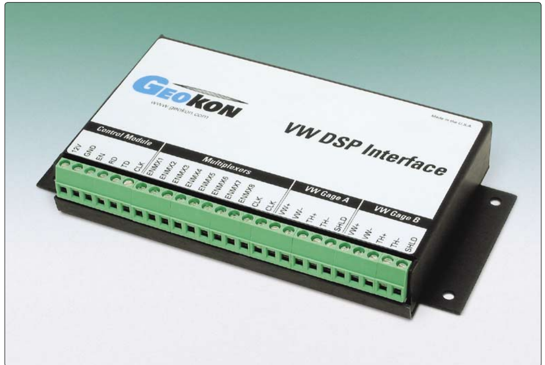
• Model 8020-47 DSP Vibrating Wire Digital Signal Processor.