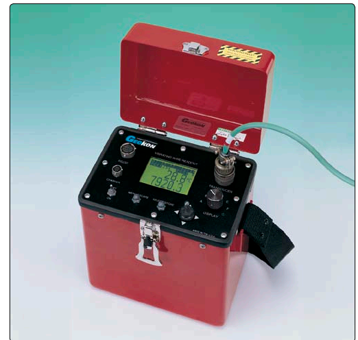
● Geokon Model GK-403 Vibrating Wire Readout Box.