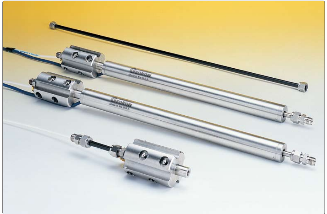
• Model A-9 Retrievable Extensometer bottom anchor (front), transducer with anchor (middle two), and connecting rod (rear).