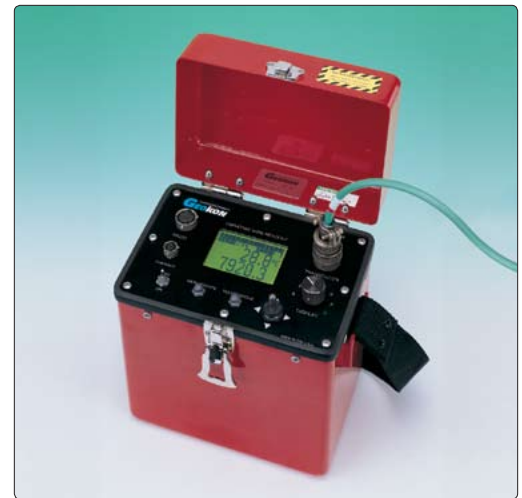
● Geokon Model GK-403 Vibrating Wire Readout Box.