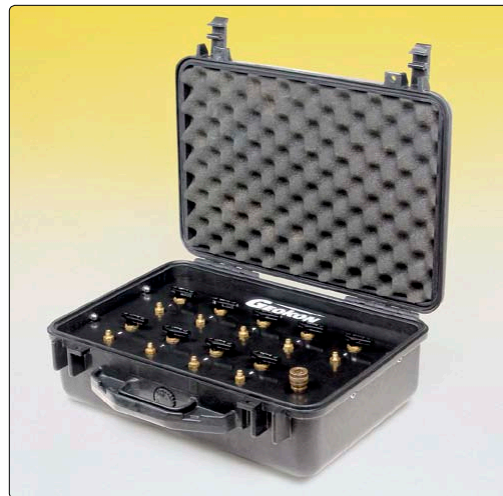
● Geokon Model 1300-3 Pressure Manifold.