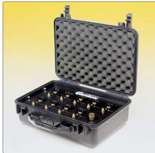
● Geokon Model 1300-3 Pressure Manifold.