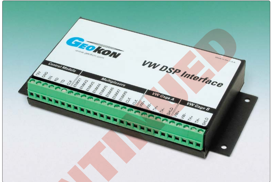
• Model 8020-47 DSP Vibrating Wire Digital Signal Processor.