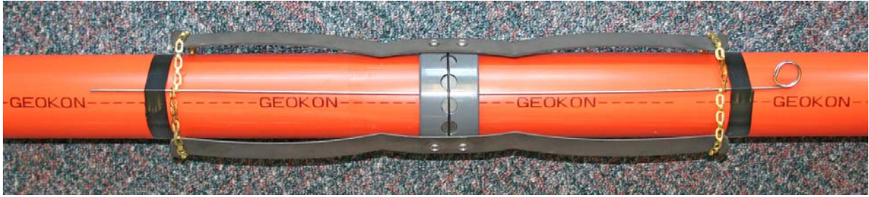
Figure 2 - Anchor Assembly - Securing the Leaf Springs

Use the chains supplied to restrain the ends of the leaf springs). The pull-pin passes through the links of the chain holding the leaf springs snug against the access tube. Use \frac{3}{4} inch electricians tape (2 turns) around the pull pin above and below the anchor, (see Figure 2). This holds the anchor pull-pin in place and makes it more difficult to pull the pin out, thus reducing the risk of prematurely tripping the anchor during installation.) It also holds the spider anchor in place preventing it from sliding up the access tube during installation.