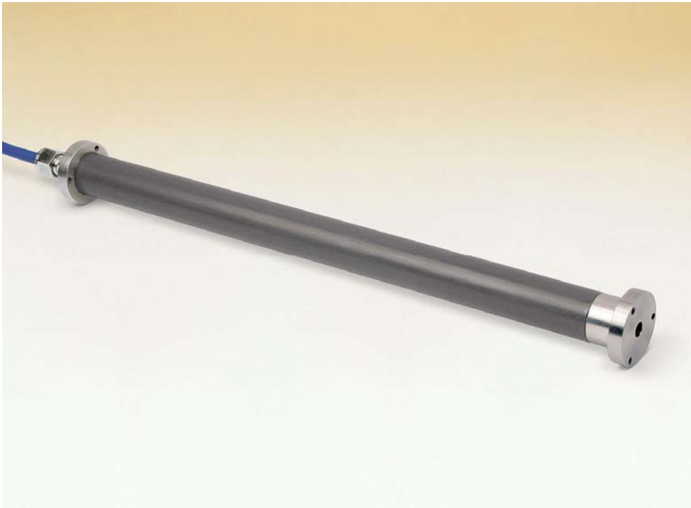
Figure1 The Model 3900 Embedment Strain Gage.

The Model 3900 Embedment Strain Gage is designed for the measurement of dynamic strains in concrete structures, asphalt roadways and soils. It comprises a full-bridge strain gage proving ring element coupled in series with a tension spring which is stretched between two end flanges. An outer PVC tube sealed with O-rings provides a waterproof housing. The end flanges are embedded and move in accordance with the surrounding material. The voltage signals from the strain gage are transmitted via cable to the readout location.