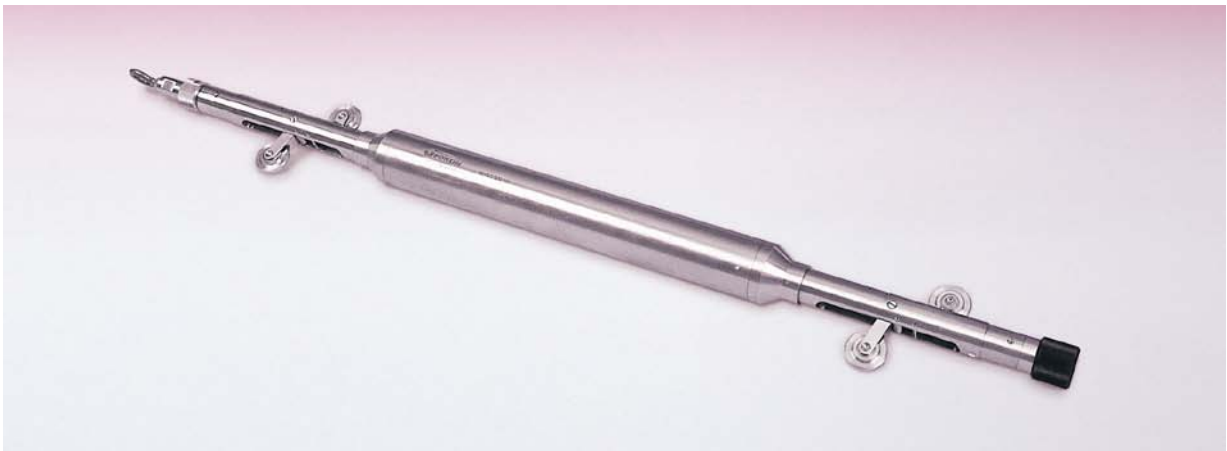
Figure 1 Horizontal Inclinometer Probe

Figure 1 shows the horizontal inclinometer probe. The probe is designed to be used in conjunction with a special cable connected to a readout box and to be used with grooved inclinometer casing. This manual describes the use and maintenance of the inclinometer probe and cable. Further details of the operation of the readout box are to be found in the GK-603 manual; and for installation of the inclinometer casing in the Model 6500 installation manual.