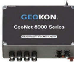
Eight-Channel Node* 8901-NA-08C-CBL