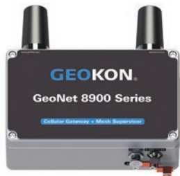
Cellular Gateway 8901-NA-LTM-USB | 8901-NA-03G-USB