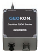
Single-Channel Node (10P) 8901-NA-01C-10P