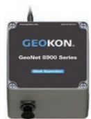
Network Supervisor (USB) 8901-NA-SUP-USB