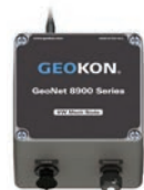
Single-Channel Node (CBL) 8901-NA-01C-CBL