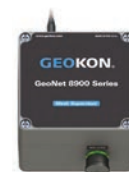
Network Supervisor (RS-232) 8901-NA-SUP-232