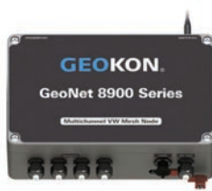
Four-Channel Node* 8901-NA-04C-CBL