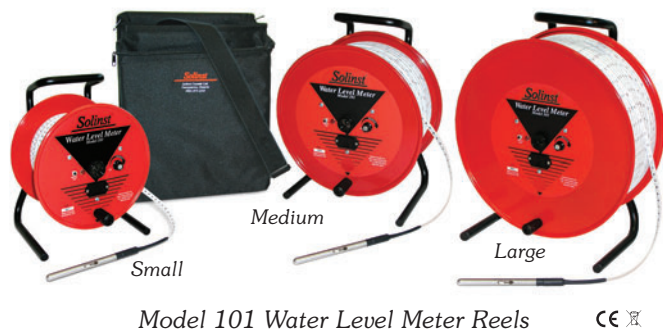
Model 101 Water Level Meter Reels CE

* PVDF laser marked tapes are only available in these lengths