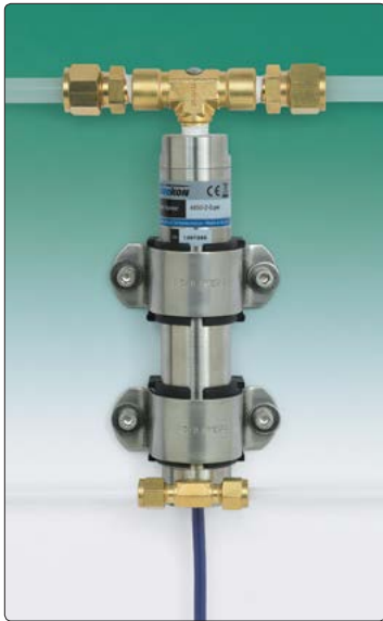
● Model 4655 Multipoint Settlement System, vibrating wire pressure transducer.