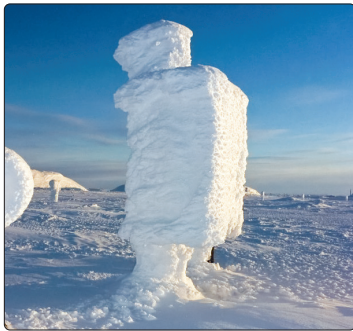
• Winter view of the above installation.*