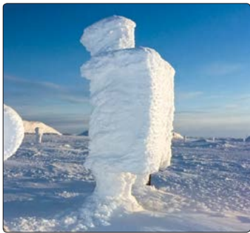
• Winter view of the above installation.*