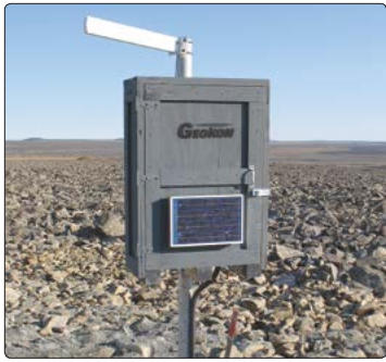
• Summer view of the GEOKON Model 8025 Data Acquisition Station measuring a 70 m deep Thermistor String in mine tailings, located in northern Canada.*