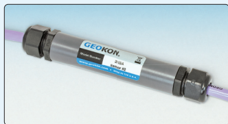
• Close-up of an encapsulated sensor from the Model 3810A Addressable Thermistor String.