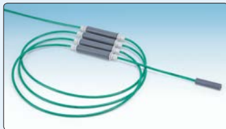
• Model 3810A Addressable Thermistor String, shown with 4 sensors.