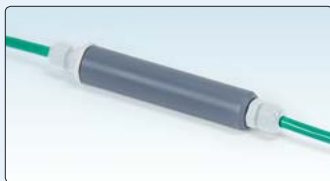
• Close-up of an encapsulated sensor from the Model 3810A Addressable Thermistor String.