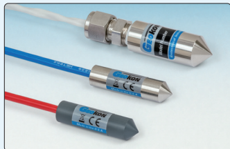
• Model 3800-1-1, Model 3800-2-1 and Model 3800HT Thermistor Probes.