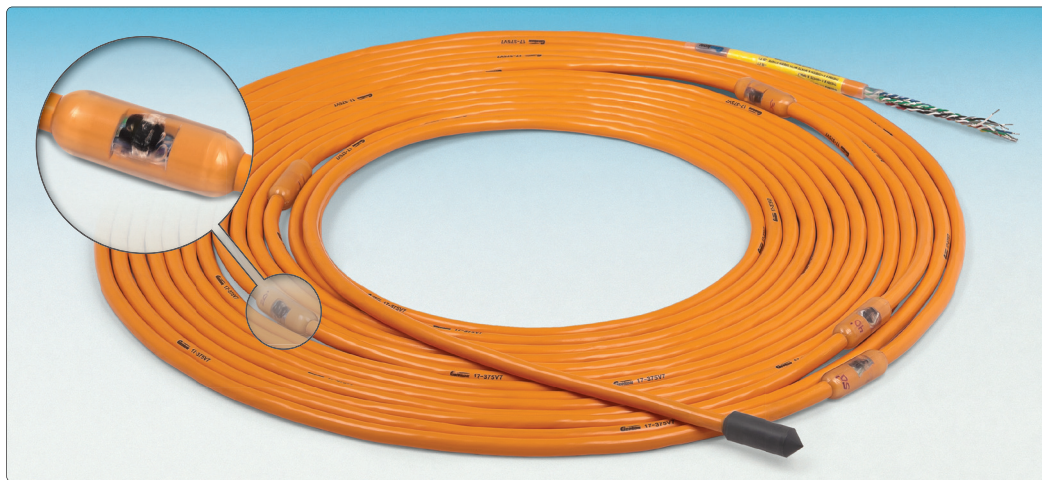
• Model 3810 Thermistor String (inset shows a close-up of an encapsulated sensor).