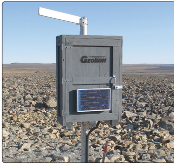
• Summer view of the GEOKON Model 8025 Data Acquisition Station measuring a 70 m deep Thermistor String in mine tailings, located in northern Canada.*