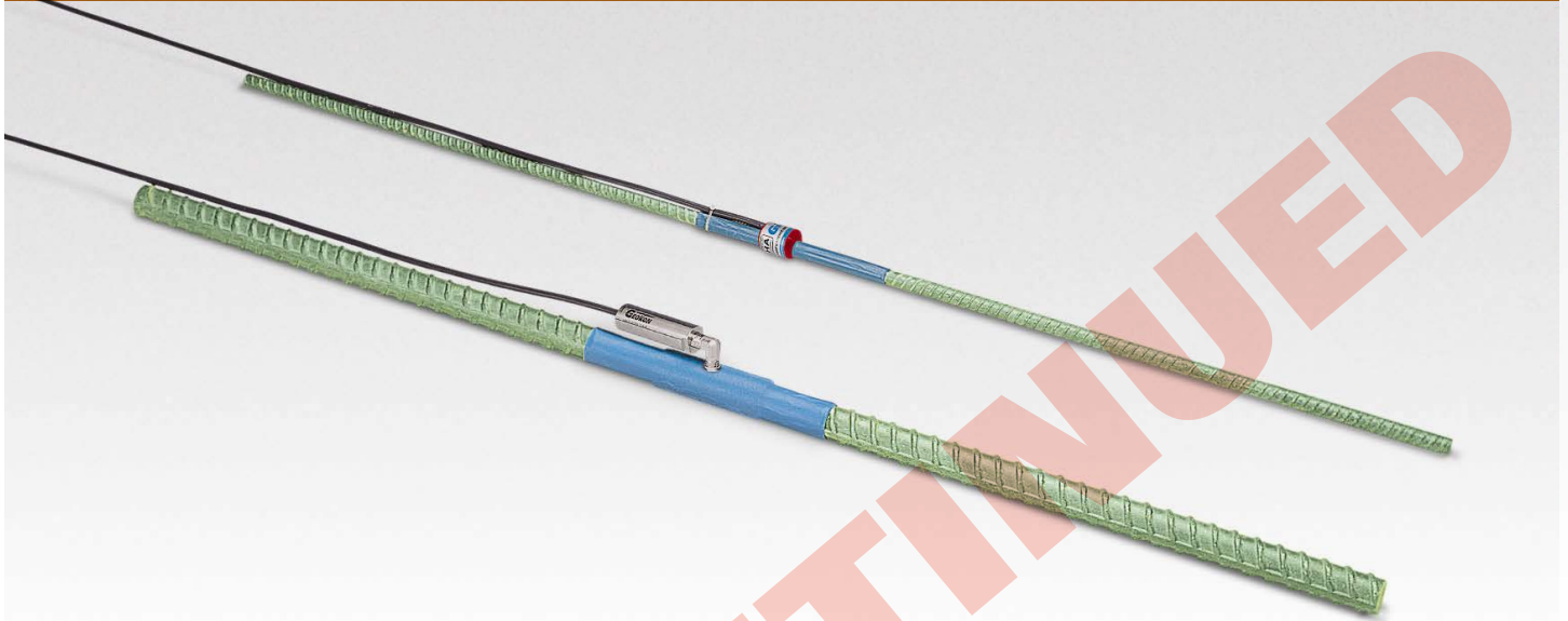
Model 3911A Rebar Strainmeter (front) and the Model 3911 "Sister Bar" (rear).