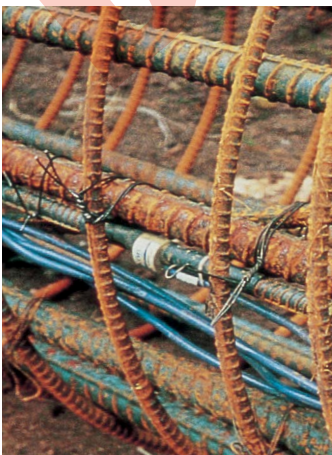
Close-up of Model 3911 shown as installed in concrete pile reinforcing cage.