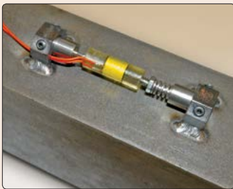
● Model 4150 shown with optional arc-weldable mounting blocks.