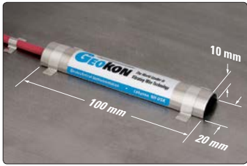
● Model 4150 under the Model 4150-1 protective cover plate, with dimensions.