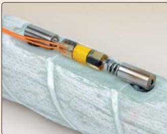
● Model 4151 Strain Gauge mounted to a fiberglass rebar.