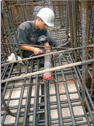
• Model 4370 installation.

The Model 4370 was developed in conjunction with the MPA Braunschweig, Germany.