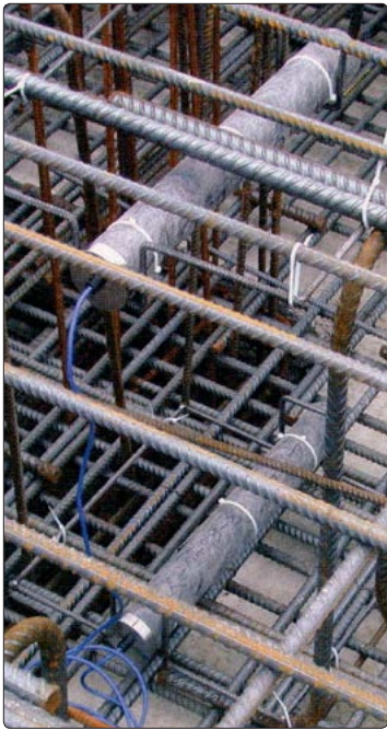
● Model 4370 installation.