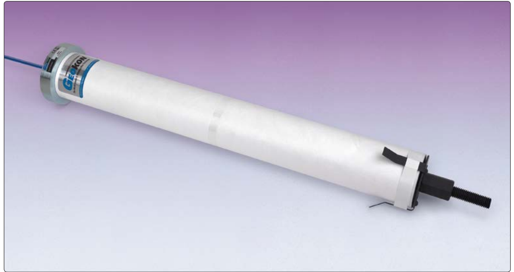
• Model 4370 Concrete Stressmeter.

The Model 4370 was developed in conjunction with the MPA Braunschweig, Germany.