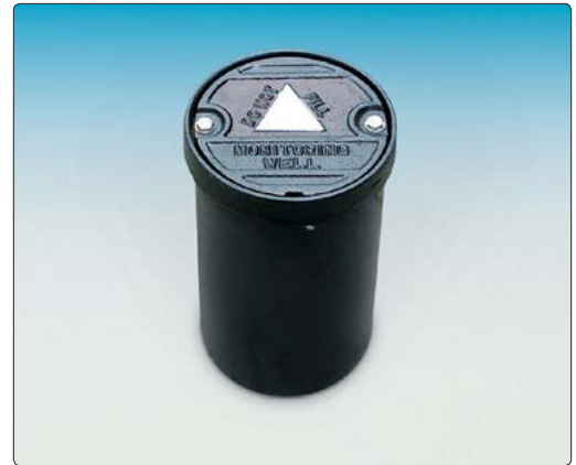
• Typical well cover.*