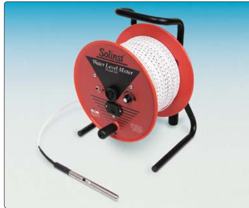
• Solinst Model 101 Water Level Meter.