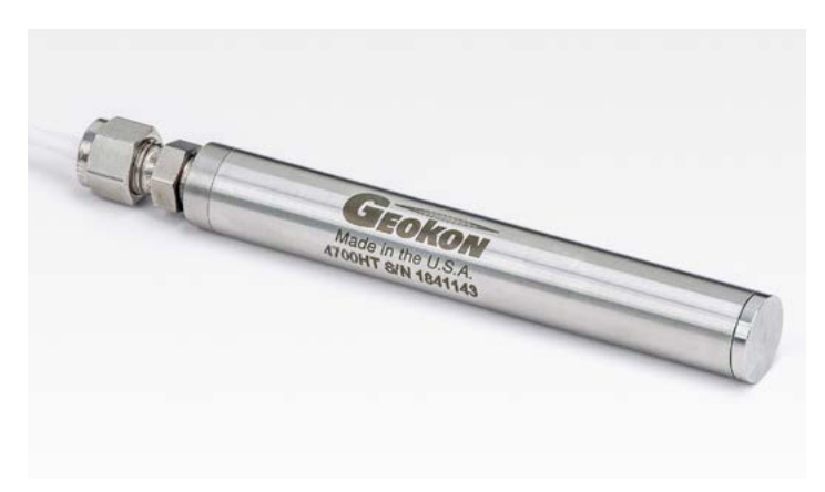
Model 4700HT High Temperature Vibrating Wire Temperature Sensor.