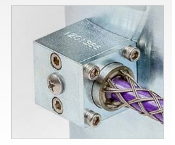
Closeup of cable insertion showing Kellems® wire mesh grip.