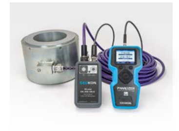
Model GK-406 (Right) utilizing a Model GK-406-MUX (Center) to read a VW Load Cell (Left).